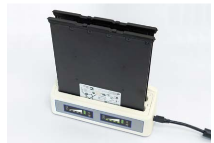
Two-bay battery charger